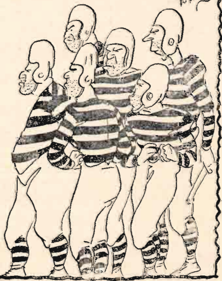
"We're supposed to play Penn State, not State Pen!"